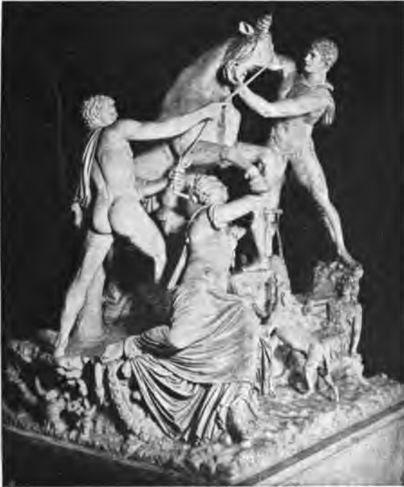
Fig. 4. Dirce tied to the bull.

Bacchantes, votaries of the wine-god Bacchus. Dirce came, by chance, to the same place, and finding the hated Antiope, she ordered Amphion and Zethus to kill her by tying her to the horns